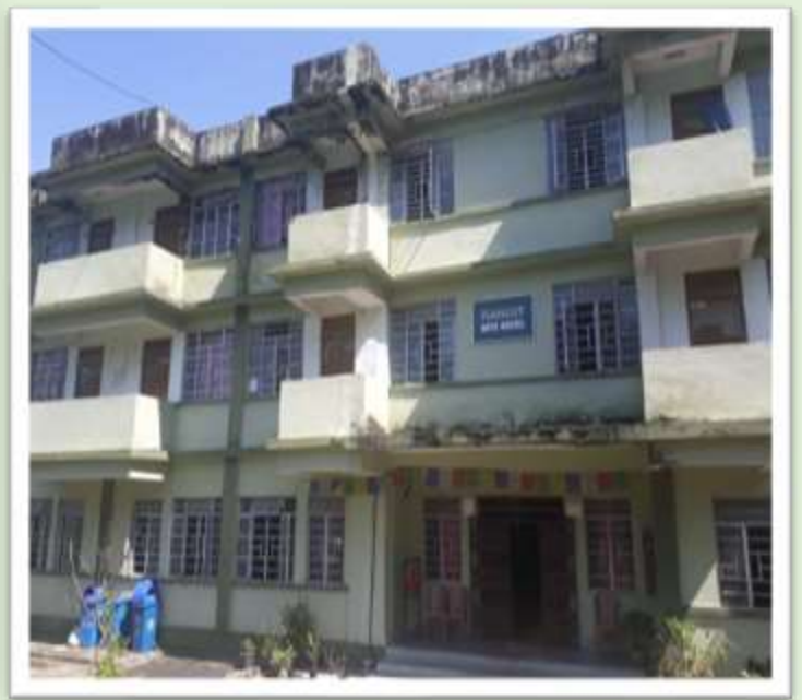
Pic: Rangit Boys Hostel 2