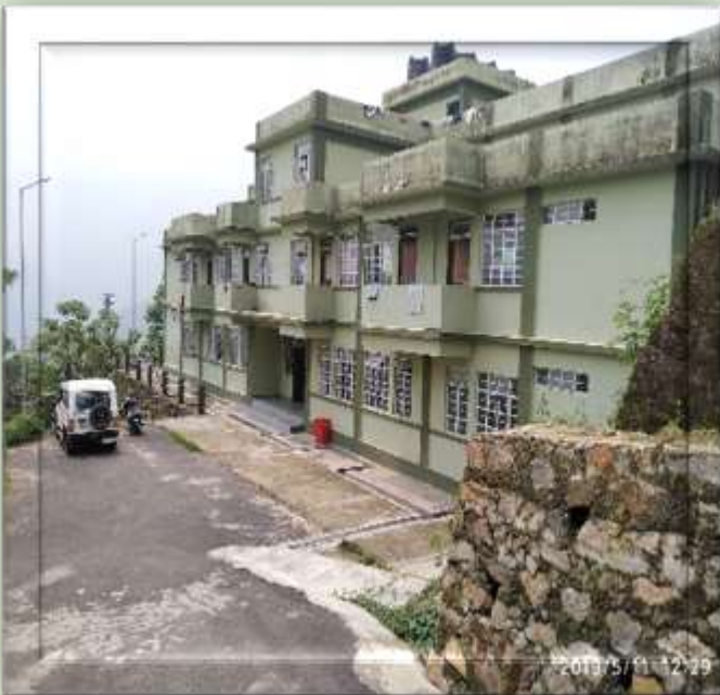
Rangit Boys Hostel 1