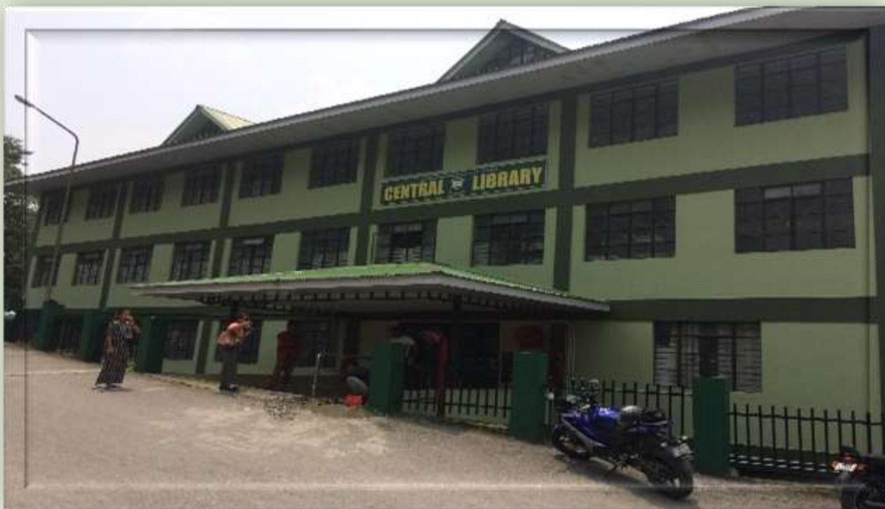
Pic: Central Library Building

where they may browse through materials provided or study. Internet facility with INFLIBNET is available to the students wherein they can browse e-books and journals through JSTOR among others.